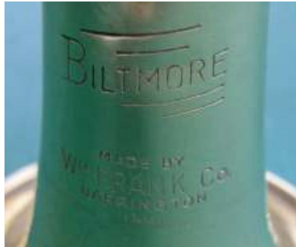
Classic model #14456 c.1950