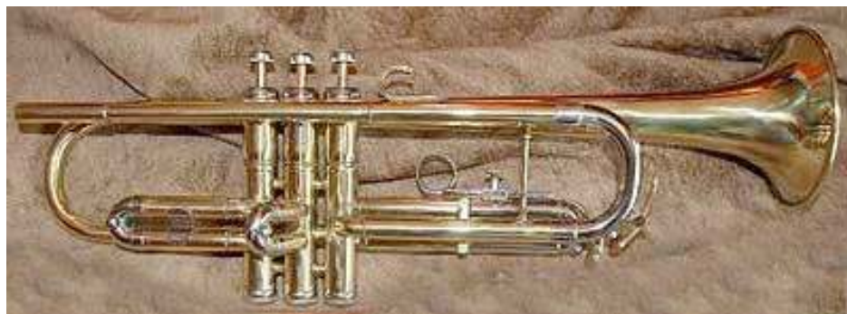
Biltmore model #11100 with 0.438" bore